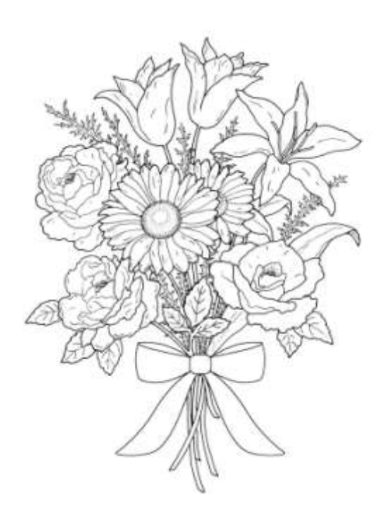
Wish You Good Luck!